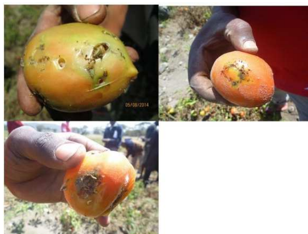
Figure 4. Infested tomato fruits by Tomato leaf minor (TLM)

Temperature above the optimal for banana production (27-38°C) lead to infestation of sucking insects such as mites and aphids, as experienced in Embu County [26].