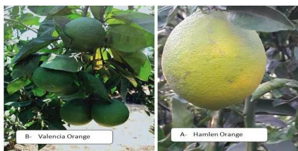
Figure 1. Field image of early Hamlen orange and late Valencia citrus fruits.